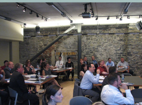
La cérémonie d'ouverture par l'Assemblée