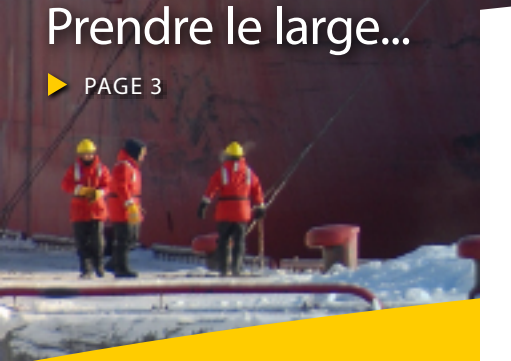
VOL. 19 - NEWSLETTER Nº 168 MARCH 2024