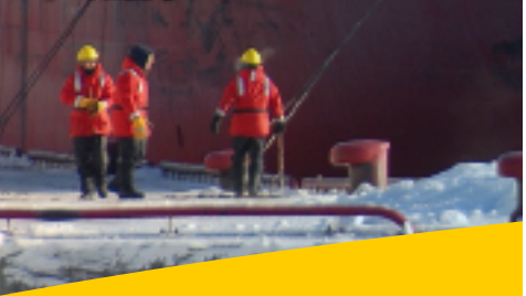
VOL. 19 - NEWSLETTER Nº 168 MARCH 2024