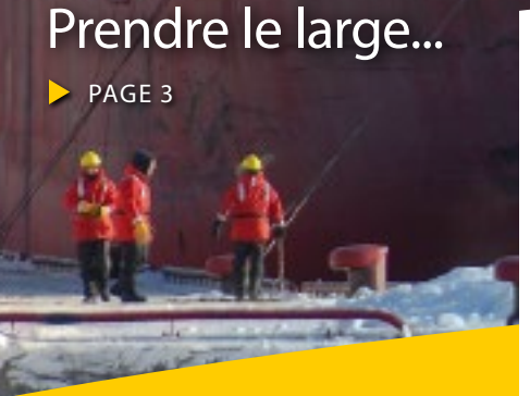
VOL. 16 - NEWSLETTER Nº 146 OCTOBER 2020